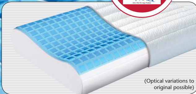
(Optical variations to original possible)