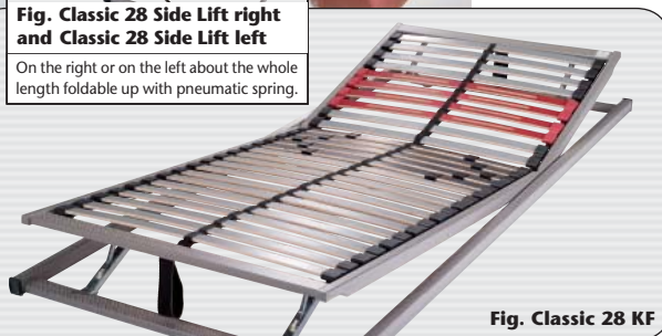
Fig. Classic 28 KF

On the right or on the left about the whole length foldable up with pneumatic spring.