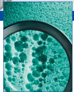
Breathable and moisture regulating cell structure, similar to that of a natural sponge.

Mattress BÜLTEX® from SCHLARAFFIA is the most successful mattress technology launch of the 90s. The secret of success lies in the extraordinary material properties. The patented, award winning production process is unique in Europe, featuring outstanding test results for comfort, temperature maintenance, and ecological aspects. Based on this, SCHLARAFFIA has now developed BÜLTEX® plus, with revolutionary new plus points for perfect body support and healthy sleep.