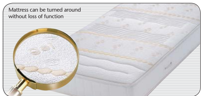
Mattress can be turned around without loss of function